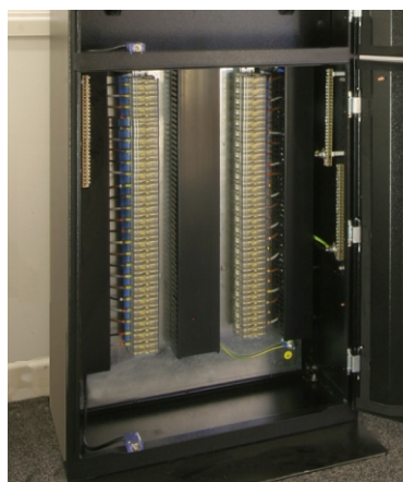
Typical termination section