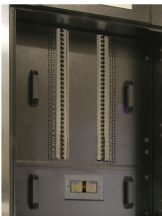
Distribution section MCB's

Format can be customised to suit individual client requirements and will accommodate components from most manufacturers